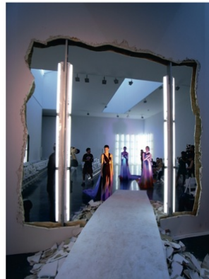
Previous spread, clockwise from left: LOUIS VUITTON SS13, RODARTE AW09, LOUIS VUITTON SS13, as before; JIL SANDER menswear SS13, MIU MIU SS13, This spread, clockwise from top right: ROLAND MOURET SS13, RODARTE SS09, CELINE SS11, RODARTE AW11, KENZO AW12, PRADA menswear AW12, GARETH PUGH AW09